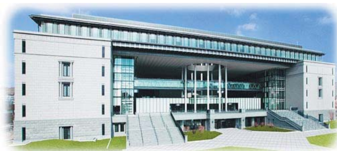
▲ Kagoshima Public Access Center

LOCATION: The symposium will be held at Kagoshima Public Access Center, Kagoshima.