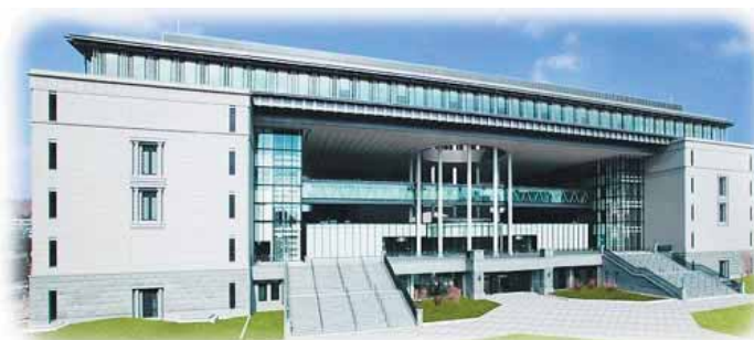
▲ Kagoshima Public Access Center

LOCATION: The symposium will be held at Kagoshima Public Access Center, Kagoshima.